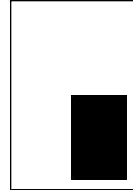
1/4 Page Ad